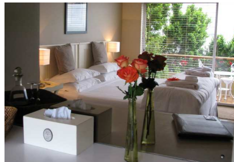
TYPICAL ROOM AT THE MANOR